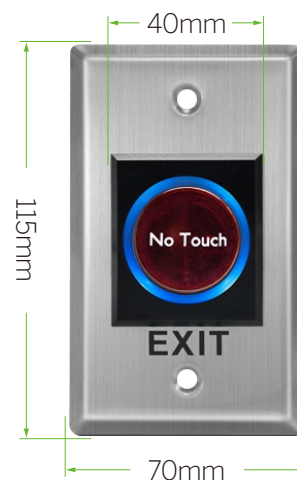
EB-16 115 x 70 x 25mm