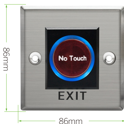
EB-17 86 x 86 x 35mm